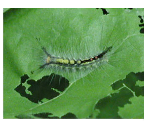
Figure 1. Larva of whitemarked tussock moth feeding on blueberry foliage

Regular scouting of bushes can provide an early warning of а tussock moth infestation. Larvae are often found on the underside of leaves, so turning over leaves with feeding damage can help locate larvae. Beware of the allergenic hairs and approach with caution! Past history of larvae in harvested fruit is a good indication of the need to be alert for their presence in the following In observations vear. growing conducted this season, fields with good fruitworm control programs after petal-fall had much less tussock moth pressure at harvest.