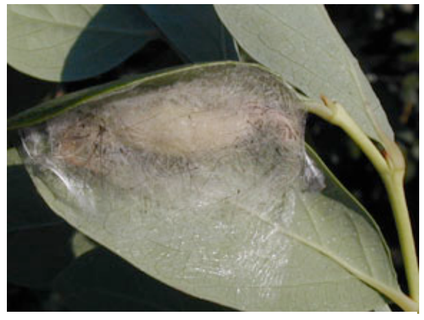
Figure 2. Whitemarked tussock moth pupal case

primarily a pest due to their presence around harvest time, when their allergenic hairs irritate the skin of fruit