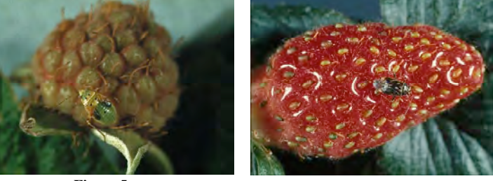
Figure 5. Figure 6.