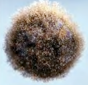
Flower blight (left) and postharvest rot (below) caused by Botrytis.