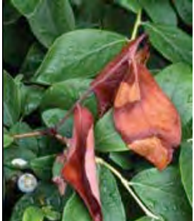
Leaf lesion (left) and twig blight (right) caused by Botrytis.