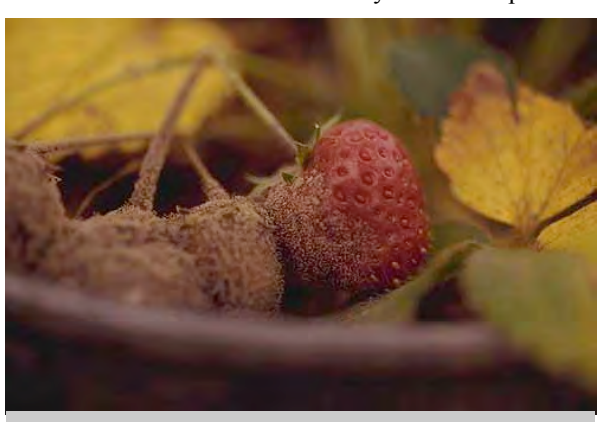
Note the gray, fuzzy growth over these berries.

harvest. In advanced stages, the fungus produces a gray mold over the fruit surface. Rot may not develop until after