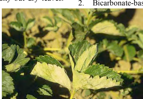
underside of leaves.

Conidia are able to begin germination after 6 hours and complete it within 24 hours, irrespective of temperature. Lesion expansion is related to temperature but does not seem to be related to relative humidity. It is a highly specialized pathogen that forms a close association with the host. Conditions that favor the host also favor the pathogen. Much of the fungus remains on the outside of infected plant parts but sends in rootlike structures,