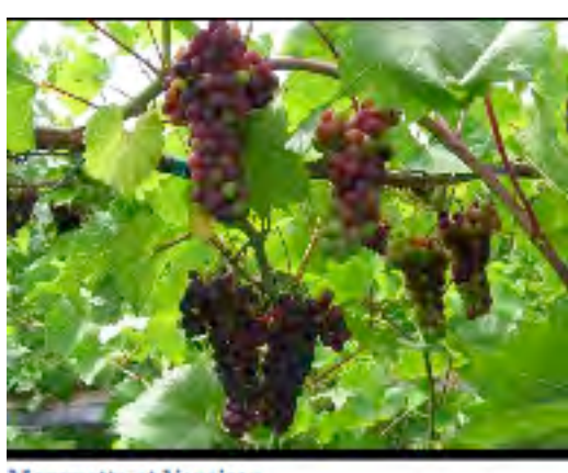
Marquette at Veraison

tourism are huge industries in Vermont and cheese is one of its main products and attractions. What goes better with cheese than wine?