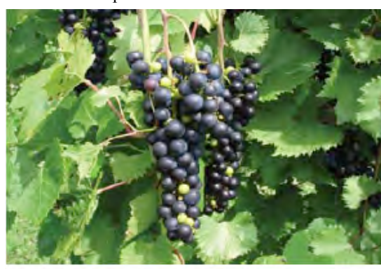
Figure 2. Marguette at veraison

and anthocyanins, terpenes, and other flavor and aroma compounds can be very important to wine quality as well. And of course, freedom from rots is an important consideration. Unlike some other fruits, grapes do not continue to ripen after harvest. Consequently, it is important to harvest grapes at the peak of quality and with the desired parameters for the intended use.