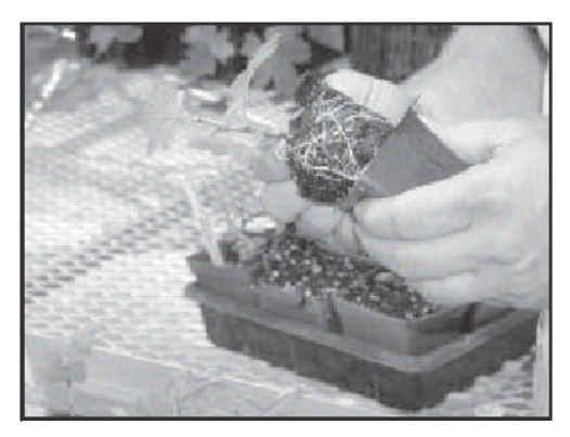
Inspection of newly rooted gooseberry cuttings.

additional hormone. Some of these species are the ground covers and shrubs. Other species will require low to medium concentrations of hormone and a few will need high concentrations for best rooting. A word of caution on hormone, "more is not always better." In the references concentrations will