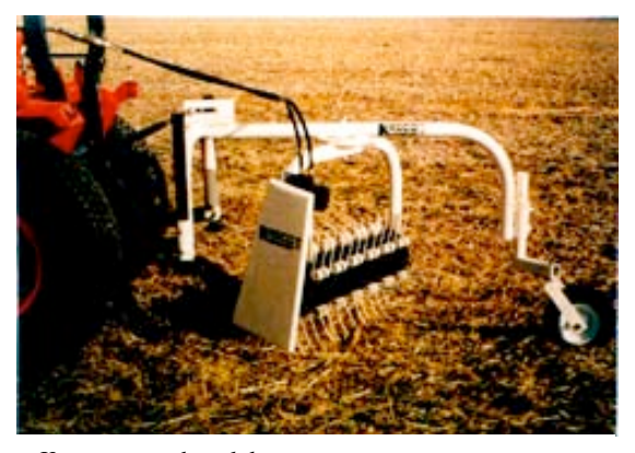
Kasco straw demulcher, www.marketfarm.com/cfms/straw_demulcher.cfm

What is a good mulch material? The traditional mulching material for strawberries in New England is straw. Straws from wheat, rice, oats, or Sudan grass work well. Straws coarser than Sudan grass are not