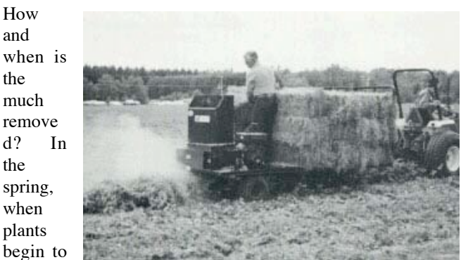
Mulchmaster<sup>™</sup> strawberry mulcher, www.agromatic.net/mulch.html

winter mulch (new green tissue), the mulch should be raked off the rows to allow sunlight to penetrate and reach the foliage. Delaying removal will delay plant growth and flowering and may reduce yield. Mulch can be raked off by hand with ordinary yard rakes in smaller plantings. In larger plantings, various mechanical tools are available ranging from modified hay rakes and tedders to equipment specifically designed for the purpose.