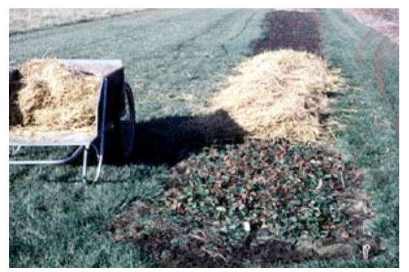
from freezing/ thawing cycles during the winter. So, a key to consistent quality strawberry production in cold climates is in protecting the plants from severe temperatures or temperature swings through the practice of mulching.

Production systems can also affect the need for mulching. Plants on raised beds, for example, are more vulnerable to cold and desiccation injury than plants in level plantings, especially in locations that are exposed to strong winter winds. Annual production systems, such as fall planted plasticulture, may utilize less hardy or disease susceptible cultivars. As we will see, mulching practices must adapt to these new systems.